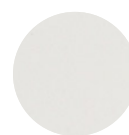
Metal Matt Optic White