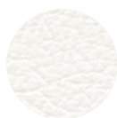
Leather Optic White