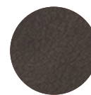
Faux Leather Vintage Ebony