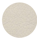
Faux Leather Vintage Hemp