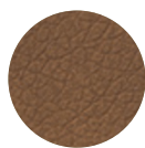
Faux Leather Vintage Tobacco