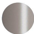
Metal Matt Taupe